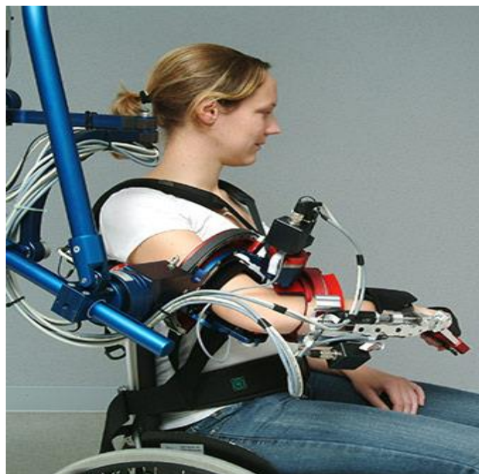
Fig 3: An upper limb rehabilitation [9] .

rehabilitation targets, or aid mobilization. These robots may be used in the inpatient setting and in community rehabilitation centers. Current rehabilitation robots are large and relegated to the clinic. Figure 3 shows an upper limb rehabilitation [21] .