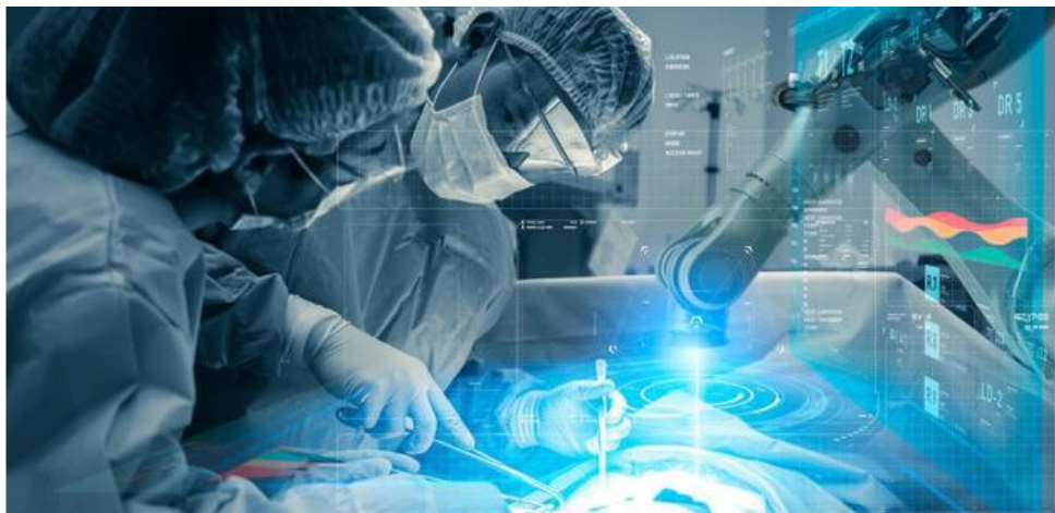
Fig 5: Robotics' surgical precision [10] .

Robotic Surgery: The most notable use of robotics in medicine is in surgery. Robotic surgery is a surgical procedure conducted using robotic technology, in which a surgeon operates the system from a console. Robotics surgical systems, such as the da Vinci surgical system, enable surgeons to perform minimally invasive surgeries with increased precision, reduced blood loss, and shorter patient recovery times. Robotic surgery has revolutionized medicine, enabling complex procedures to be performed with precision and less invasively. Figure 5 illustrates the precision of robotics in surgery [22] .