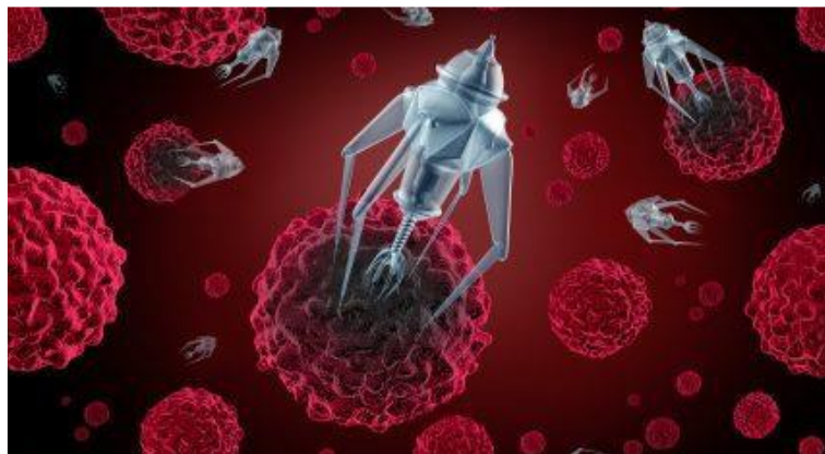
Fig 4: Targeted treatment nanodots [10] .