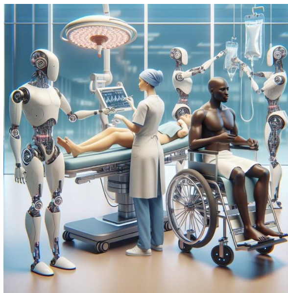
Fig 1: Use of robots in medical operation [5] .

transformed modern healthcare. Medical robotics encompasses a diverse set of technologies that can assist medical workers in providing more accurate, effective, and minimally invasive medical care. These systems facilitate automation of surgery, rehabilitation, patient assistance, and pharmacy. Robotics in healthcare is a revolutionary advancement in the engineering sector that combines innovative technology with medical practice to improve patient outcomes, enhance surgical precision, and optimize hospital processes. The general purposes of robots in healthcare are classified as surgical, rehabilitation and mobility, radiotherapy, socially assistive, telepresence, pharmacy, disinfection, delivery and transport, and interventional and imaging assistance. As demonstrated in Figure 1, robots are used in medical procedures [12] .